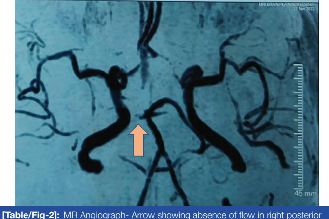
[Table/Fig-2]: MR Angiograph- Arrow showing absence of flow in right poste cerebral artery.

therapy was given after two weeks during follow-up as the main stay of treatment and the patient was discharged once stable. The platelets improved to the normal limits. During the follow-up visit she